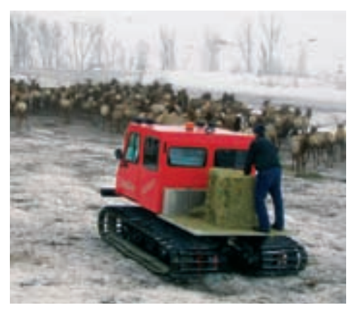
The PistenBully Scout carries material and personnel to practically any location — and protects the ground.