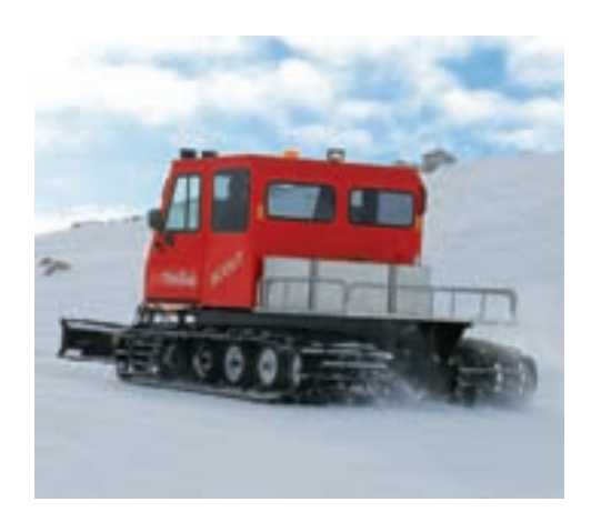
Regardless of how high the mountain shelter is or how difficult it is to reach: the PistenBully Scout reaches its goal quickly and reliably.