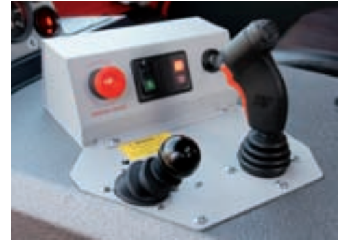
The electronic hand throttle is infinitely adjustable by lever. There are no disruptive cables in the interior.

The display instruments on the PistenBully Scout are arranged clearly. All important data is available at a glance. The new PowerView Display bundles all information and can be programmed so that the engine switches itself off if preset values are exceeded. For example, this avoids a high revolution speed.