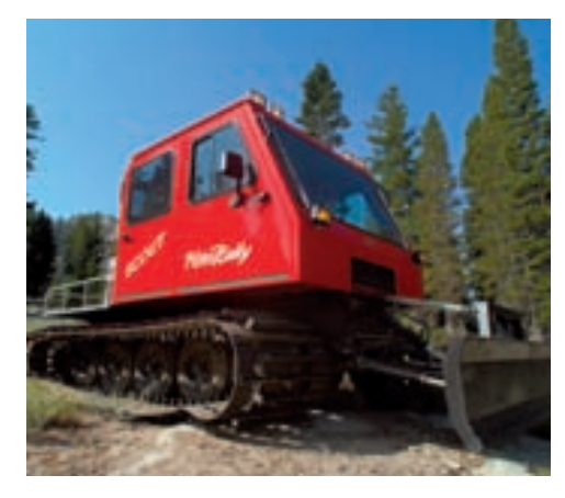
The PistenBully Scout does valuable work, not just in snow, but also on impractical forest terrain or on wet agricultural land.

The PistenBully Scout is extremely flexible to use and can take a maximum load of 750 kg. The small powerhouse can be steered precisely. Thanks to its large track area, it can climb almost any incline effortlessly.