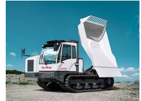
Side tip dumper