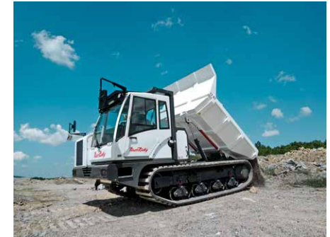
Rear tip dumper