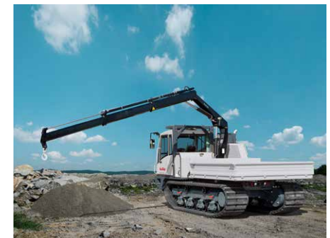
Carrier with crane